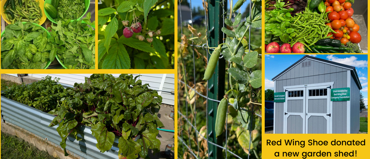
Red Wing Shoe donated a new garden shed!

Since its establishment in 2019, the garden has been a source of fresh fruits and vegetables for food pantry participants, while also serving as a hands-on learning space for community gardening. Pantry participants value the quality and variety of produce, and volunteers have observed that the garden yields superior produce compared to other sources. Educational sessions covering nutrition and gardening topics are conducted in the garden. We are grateful to our supporters, including UW-Madison Division of Extension Growing Together, St. Croix Valley Master Gardener Association, and the Henkel Foundation.